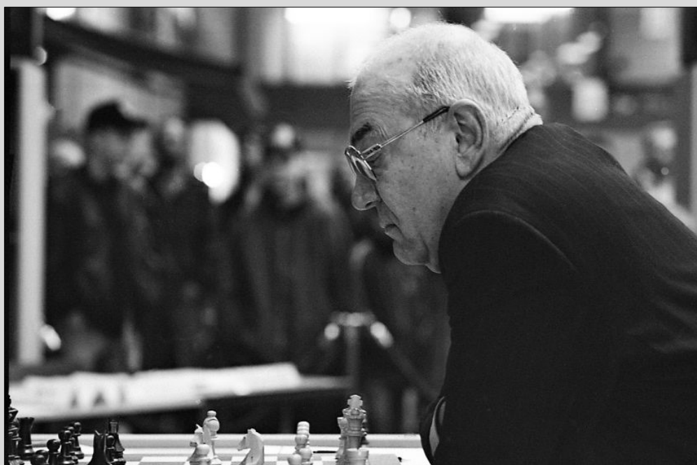
Viktor Kortchnoi

“I HAVEN'T DISCOVERED ANYTHING HUMAN IN KARPOV YET”