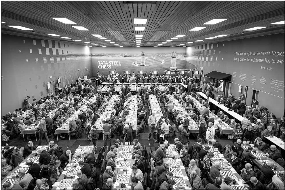
Overview of the tournament hall of the Tata Steel tournament

concentrate on our conversation, while at the same time a mishmash of players were chatting loudly to each other about their recently finished games. So in Wijk I asked either for a separate interview room around the tournament hall where I could have a real conversation with a player undisturbed, or I made an appointment in the hotel – at Het Hoge Duin or the top players' resort at Zeeduin . These good conditions certainly contributed to the success of many interviews.